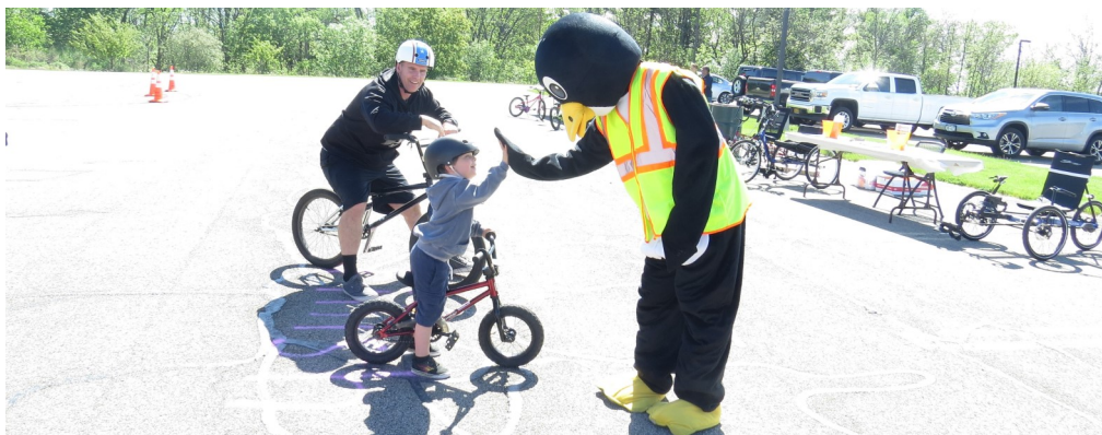
Perinton Bike Rodeo 2017